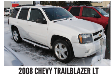
2008 CHEVY TRAILBLAZER LT 4WD, sunroof, tow pkg, leather, loaded. Only 75 K. AS LOW AS $199 A MONTH