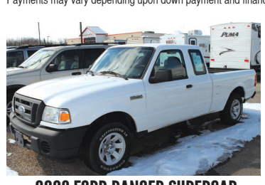
2008 FORD RANGER SUPERCAB Bedliner, air, fold down rear seat. AS LOW AS $129 A MONTH