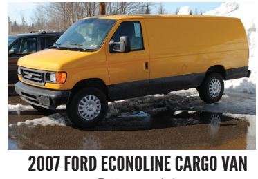
2007 FORD ECONOLINE CARGO VAN E-150, extended. AS LOW AS $199 A MONTH