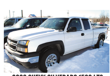
2006 CHEVY SILVERADO 1500 LT3 Ext cab, 4x4, bedliner tow pkg. AS LOW AS $199 A MONTH