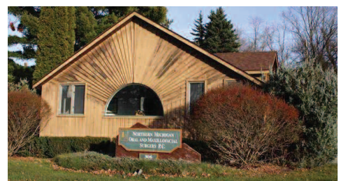
306 MAIN STREET