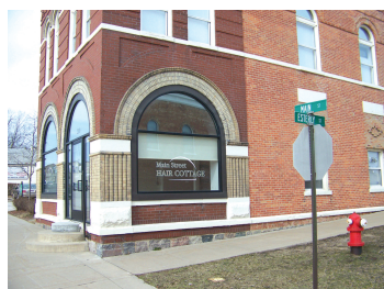
200 MAIN STREET