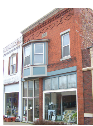
209 MAIN STREET