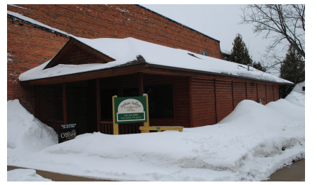
105 MAIN STREET

Stop by the East Jordan Chamber of Commerce and pick up a list of the vacant places from 1:00 PM - 3:00 PM. Owners of the buildings or realtors will be on site to give tours and answer questions. Here's your opportunity to secure a location and open your business in time for the summer season.