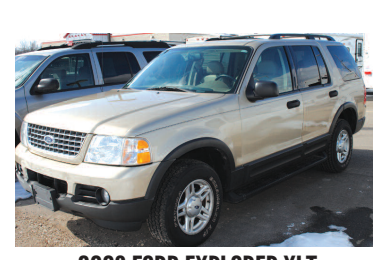
2003 FORD EXPLORER XLT 4WD, leather, tow pkg. AS LOW AS $159 A MONTH