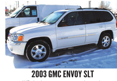
2003 GMC ENVOY SLT 4WD, leather, power moonroof, tow pkg. AS LOW AS $199 A MONTH