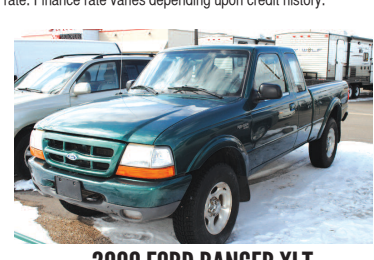
2000 FORD RANGER XLT 4WD, cruise, air, tow, 119 K. AS LOW AS $139 A MONTH