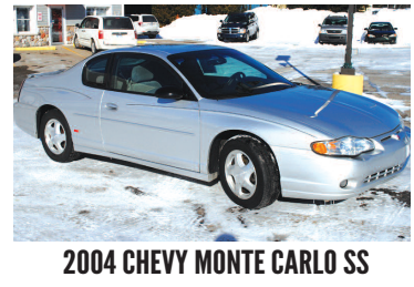
2004 CHEVY MONTE CARLO SS 2 door coupe, V-6. AS LOW AS $149 A MONTH