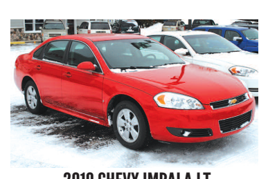
2010 CHEVY IMPALA LT Loaded, 29 MPG, very nice. AS LOW AS $189 A MONTH