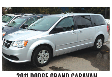
2011 DODGE GRAND CARAVAN Stow-n-Go, 4 captain chairs, seats 7, steering wheel control. Only 63 K. AS LOW AS $249 A MONTH