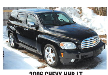
2006 CHEVY HHR LT 30 MPG, air, cruise, lots of cargo room and seats 5. AS LOW AS $179 A MONTH.