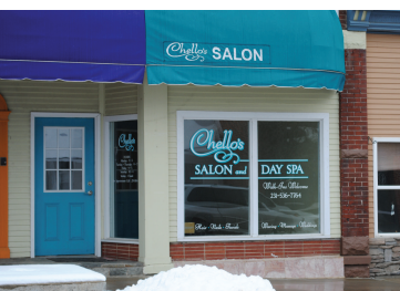
126 MAIN STREET