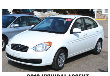
2010 HYUNDAI ACCENT Auto, air, 34 MPG, 102 K. AS LOW AS $179 A MONTH