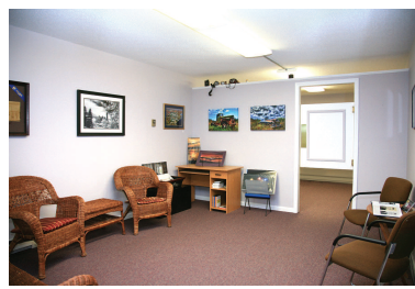
507 WATER STREET