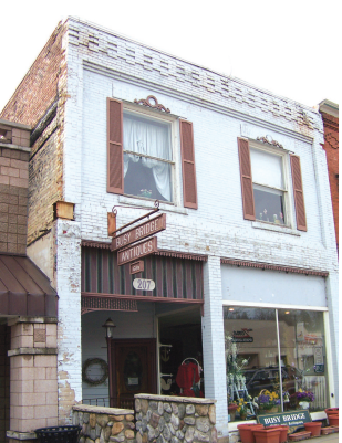
207 MAIN STREET

April 12th is the day to explore all of the vacant spaces available in the first two blocks of Main Street.