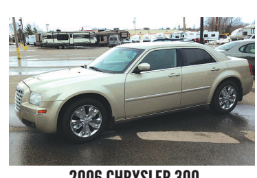
2006 CHRYSLER 300 6 Cyl, security system. Nice. AS LOW AS $179 A MONTH