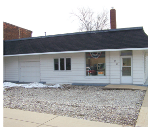
123 MAIN STREET