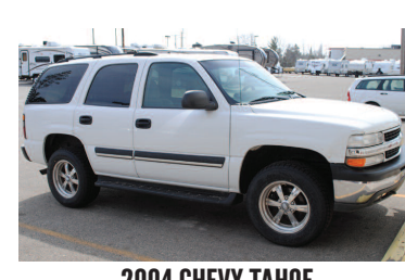
2004 CHEVY TAHOE 4x4, tow pkg, new tires. AS LOW AS $199 A MONTH