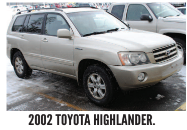
2002 TOYOTA HIGHLANDER. 4x4, 109 K, 3.0L V-6, 4 door, leather. SALE $10,995. AS LOW AS $249 A MONTH.