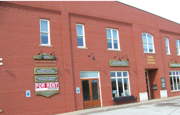
MAIN STREET CENTER