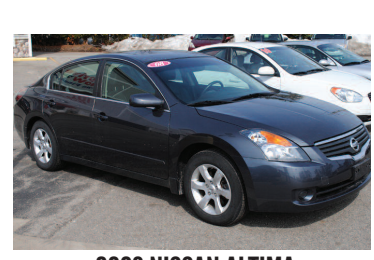
2008 NISSAN ALTIMA Leather, moon roof, 77 K. Very nice. SALE PRICE $14,995