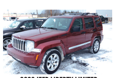
2008 JEEP LIBERTY LIMITED 4x4, leather, sunroof, tow pkg, nice AS LOW AS $199 A MONTH