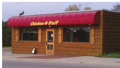
101 MILL STREET