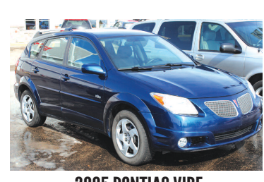
2005 PONTIAC VIBE Air, cruise, lots of cargo room. Only 59 K. AS LOW AS $179 A MONTH