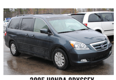
2005 HONDA ODYSSEY Touring pkg, leather, heated seats, loaded. AS LOW AS $179 A MONTH