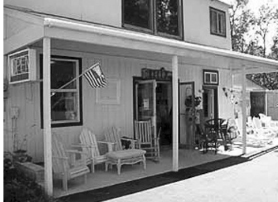
Kelly's Antiques and Furniture Barn is located at 6176 Old US 31 South in Charlevoix. The fascinating facility encompasses over 7,000 square feet of ever changing vintage furniture and accessories, plus another 1,500 square feet of custom furniture items.

in a small room off my garage. I loved working with furniture, and while attending a furniture show I discovered a new type of finish stripper that worked extremely well. I went home, tried it out, and started my new business. It kept expanding and I moved into my current location in 1990." Kelly adds, "Something we specialize in is wicker furniture items. People love old wicker furniture, and we also sell lots of old pine, oak and items made from other woods as well. Vintage furniture is generally made with solid wood or very good veneers. The workmanship and craftsmanship is excellent." The services offered at Kelly's Antiques & Furniture Barn also include customizing the size of