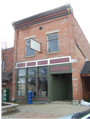
103 MAIN STREET