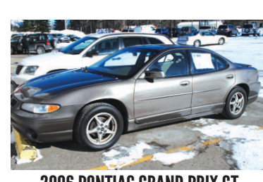
2006 PONTIAC GRAND PRIX GT V-6, traction control, 29 MPG. AS LOW AS $199 A MONTH