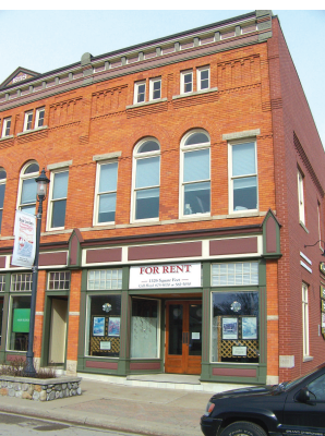
MAIN STREET CENTER